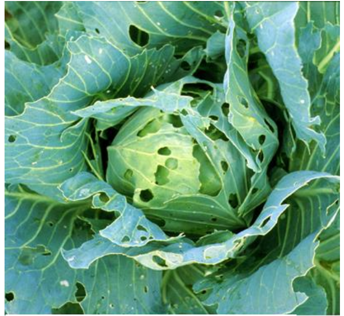
Cabbage worm damage on cabbage

The main pest of cabbage and related crops is the cabbage worm. The little green worms come from white moths you will see flying around the garden. There are three main ways to control the worms: 1) pick them off with your hands, 2) use a natural product with Bt or Dipel , or 3) keep the moths off of the plants by using a floating row cover ( http://bit.ly/1DV1hOW ).