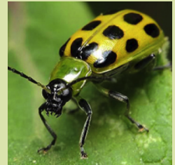
Spotted cucumber beetle