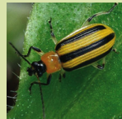
Striped cucumber beetle